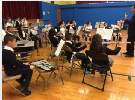
Spring Band Concert