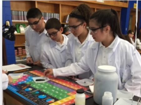
Studying the Periodic Table

With a history of 50 plus years, this Catholic elementary school in Bergen County continues to encourage Christian morals and values in a thriving academic environment. This scholarship will provide financial assistance to existing students who live a good Christian life focused on knowledge, character and enthusiasm.